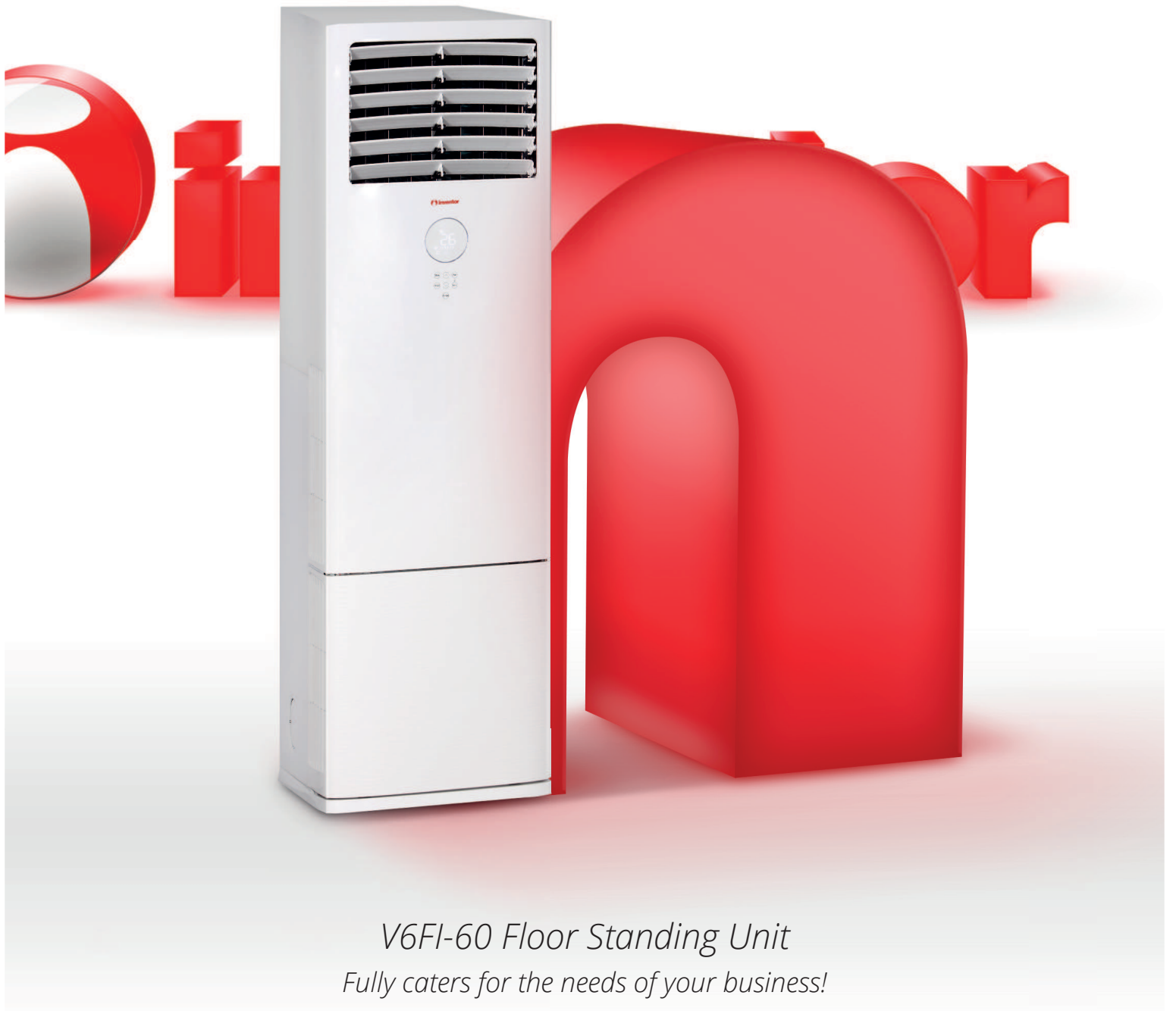
V6FI-60 Floor Standing Unit Fully caters for the needs of your business!