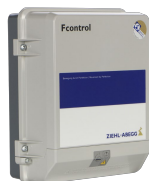
IRET INVERTER 2,5 M Code 12816