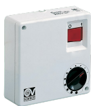
C 1.5 (COMANDO EL. 1.5 A) Code 12966