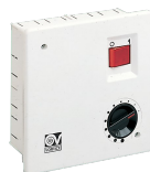
SCNRB SCAT.COM.NON REV.INCASSO Code 12971