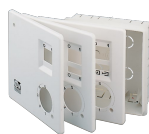
KIT SCB (TRASF.E.C.) Code 22481