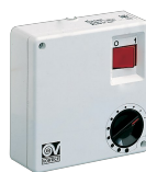
C 1.5 (COMANDO EL. 1.5 A) Code 12966