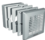
F 150/6" Code 22133