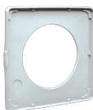
S 150/6 Code 22156