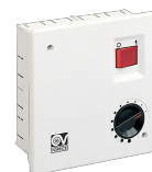
SCNRB SCAT.COM.NON REV.INCASSO Code 12971